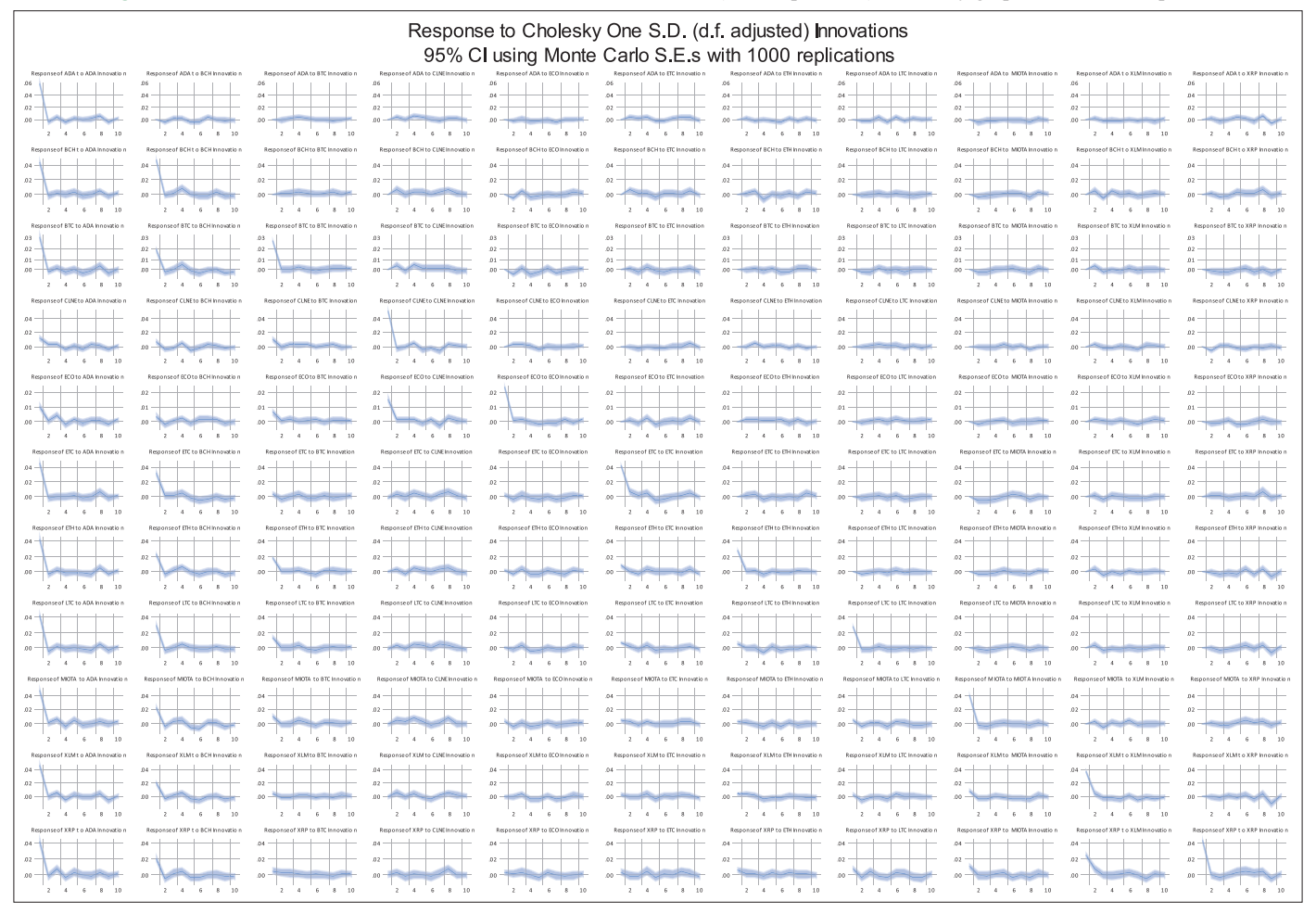
Figure 3: Estimation of the IRF model with monte carlo simulations (1000 repetitions), summary graphs for the stress period

Note: Data was worked on by the authors (software: Eviews12)